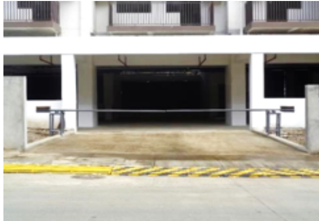
Interim Entrance to Tower 1