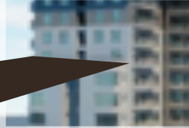
Sample Photo only (Serin West rendered photo)