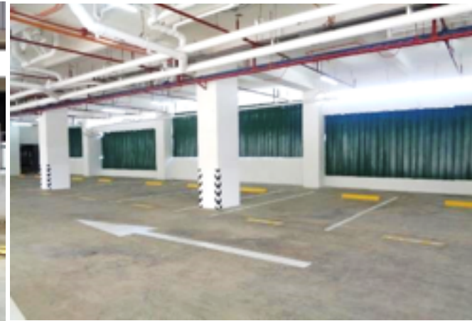
Tower 1 Parking Area