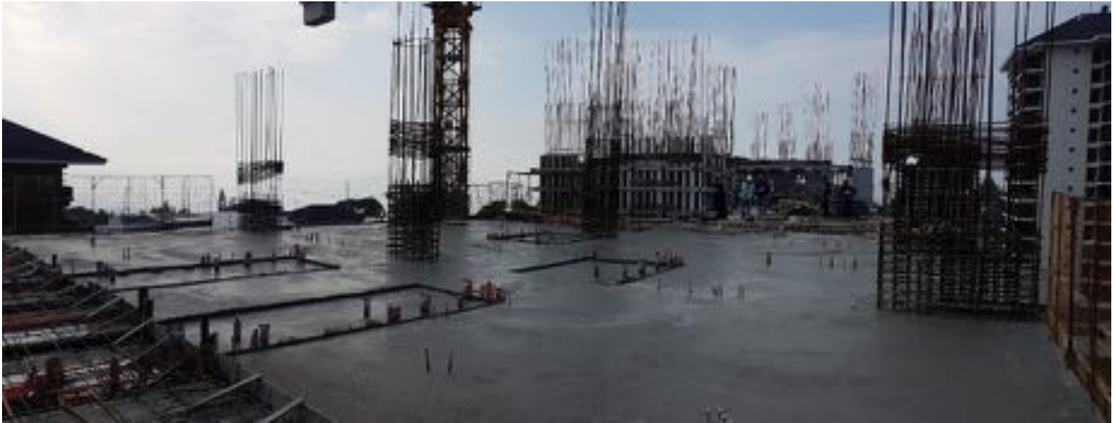
9th Floor Construction Work