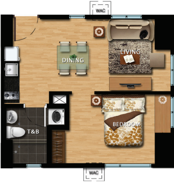
1-Bedroom Unit Approx. 39 sq.m