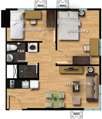
2-Bedroom Unit Approx. 47 sq.m