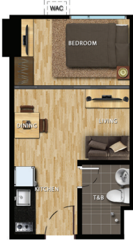
Jr. 1-Bedroom Unit Approx. 25 sq.m