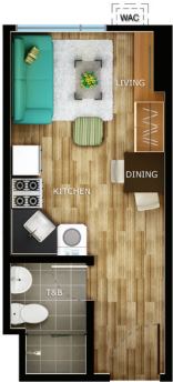
Studio Unit Approx. 23 sq.m